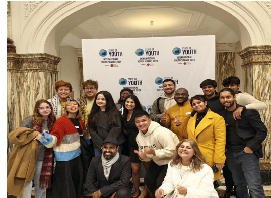
The laureates of the International Children's Peace Prize hosted workshops at the Summit

The day highlighted the power of cooperation and the importance of youth participation worldwide. A poll among participants revealed that young people are not listened to enough on issues important to them. On a scale of 0 to 100, young people gave an average score of 39 for how their views are listened to. Their message to the world was therefore loud and clear: "Listen to us!" .