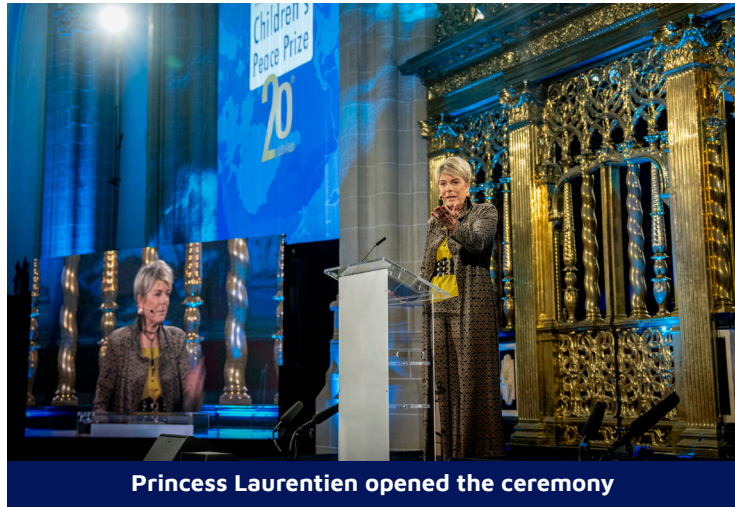
Princess Laurentien opened the ceremony