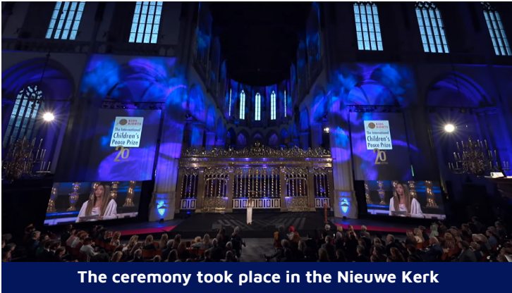
The ceremony took place in the Nieuwe Kerk