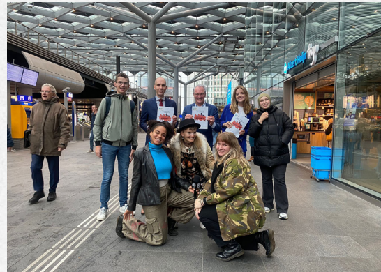
Youth handed over the report to travellers' association Rover

All the results were compiled into a report and young people handed it to Dutch travellers' association Rover. They also sent it to the Infrastructure and Water Management Committee and the results were mentioned in the national and regional AD (newspaper).