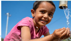
KRI in a UNICEF report

frameworks for children's rights, alongside a comparison of best practices in selected OECD countries using the KidsRights Index. The Index's 8th domain, focusing on creating an enabling environment for child rights, guides this assessment. 3