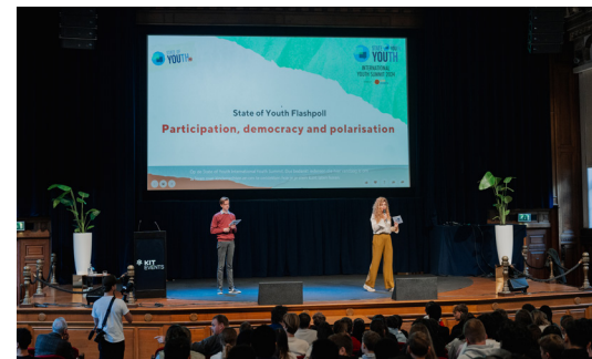
After the workshops there was a plenary session on Participation, Democracy and Polarisation